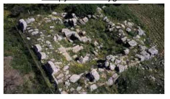
Article by Eric in Current World Archaeology magazine